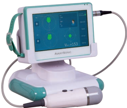
AvantSonic Z3 7" colour touch screen

AvantSonic Z5 & Z3 Bladder Scanners come with unlimited distance training delivered remotely