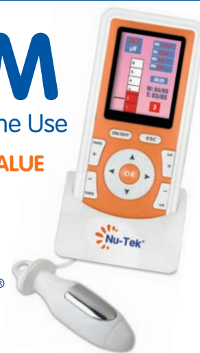
NU-TEK LEVATOR ELITE