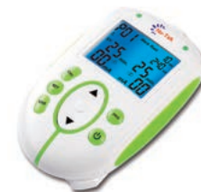
NU-TEK LEVATOR MINI

INNOVATIVE – USER FRIENDLY - ACCURATE – RELIABLE – VERSATILE – AFFORDABLE